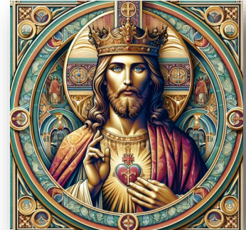
KING OF KINGS